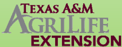
Kristy Slough CEA-AG/NR KS/AW/lm

We encourage everyone to help decorate and ride on the float!